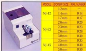
Standard set: Quicher unit with one rail