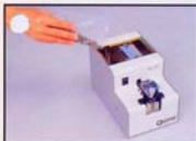
Pour screws into hopper