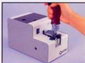
Easy pick up