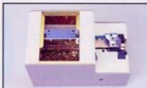
Lining up screws